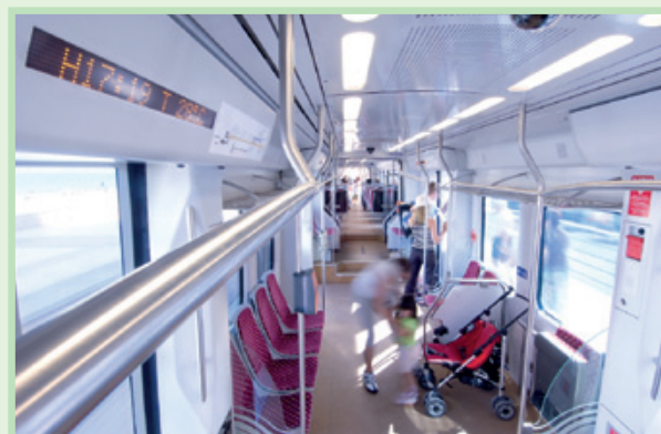
Train-tram interiors

Stainless steel offers reductions in cost, weight and energy use. These properties are essential for the success of stainless in rail transport and to ensure the sustainable growth of the railroad industry.