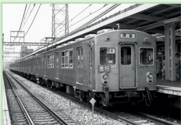
Japan's first all-stainless steel railcar (Tokyu's 7000-series)

Until the 1980s carbon steel was a popular choice for railcars due to its lower initial cost. However, extra manufacturing processes such as coating and shape-correction have increased both the initial cost and repair and maintenance charges.