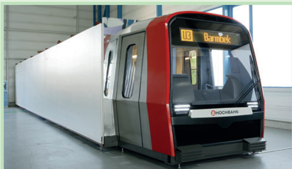
Mock-up of the next generation of Hamburg's metro cars

brushed stainless steel making its removal easier. The absence of a coating also means that the blank metallic surface does not undergo any colour changes due to UV-radiation. Repainting faded surfaces is a thing of the past.