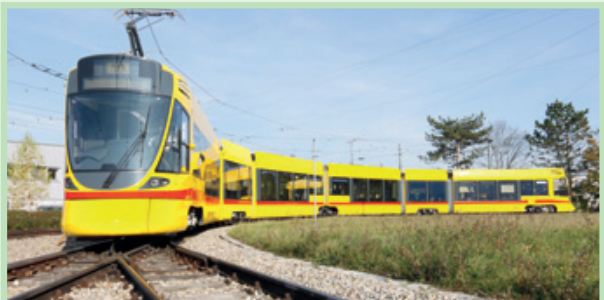
Tango light rail

“We made a very conscious choice for this material, because it is very well established within rail vehicle construction. The Basel track conditions, with their great gradients and extremely narrow curves, place the highest demands on construction and material. Streetcars which function well here function well everywhere in the world,” states Jürgen Ruess of Stadler Quality Management, the company that will build a total of 60 new Tango vehicles in the coming years for the Basel Transit Authority and Basel Transport AG.