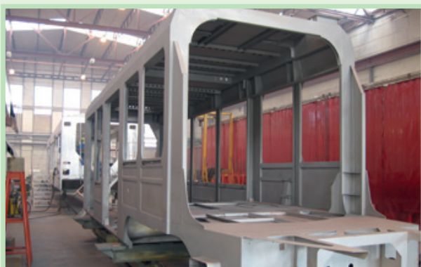
Fabrication of Tango light rail carriages in the workshop