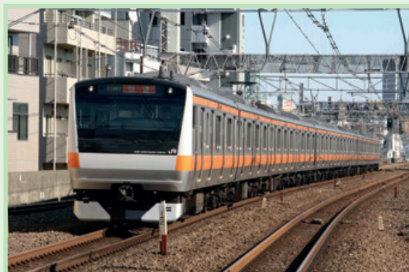
Recent stainless steel commuter train (JR East Japan's E233)

The cost of building a stainless steel railcar has been substantially lowered since the first models came into service in the 1950s. The wider use of robotics and automated processes mean that stainless railcars are often cheaper than their carbon steel counterparts.