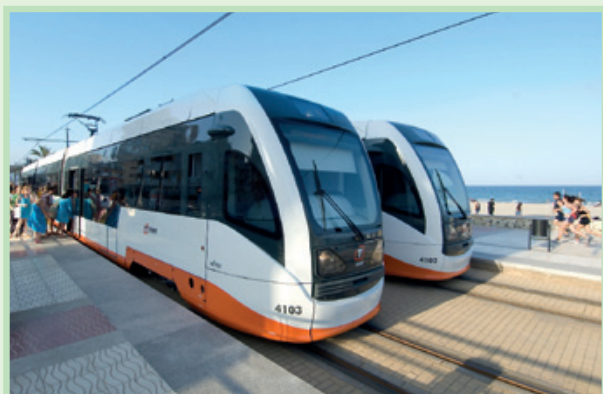
Train-tram stop next to Alicante beach

Because of its inherent strength, stainless steel can be thinner, and therefore lighter, than other materials while retaining its operational integrity. Vossloh España took this feature into account during the design of the train-tram.