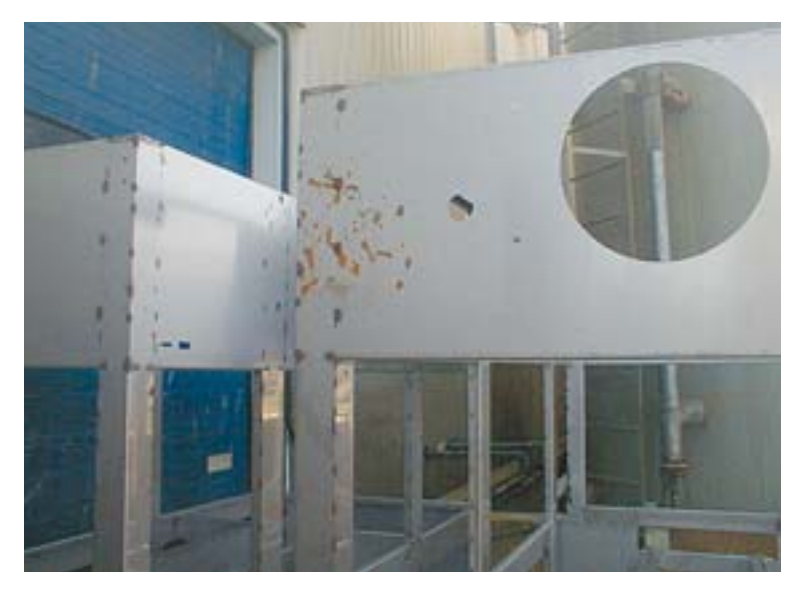
Contamination of stainless steel by iron: the example displayed is a typical case of iron contamination caused by the mixed use of iron (or steel) and stainless in the same shop without proper materials segregation. In the process of decontamination, it is important that the traces of iron are really removed and not just spread.

For optimum corrosion resistance, stainless steel surfaces must be clean and free from organic (grease, oil, paint etc.) and metallic, particularly iron or carbon steel residue, contamination. Stainless steel supplied by reputable manufacturers, stockholders or fabricators will normally be clean and contamination free. Items carefully manufactured from suitable stainless steels with an appropriate surface finish for the application, will not show rust staining, unless contamination has been introduced. Rust staining from