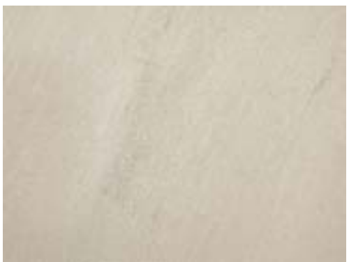
A matt grey is left on annealed mill products following descaling and pickling. Mechanical scale loosening roughens the surface.