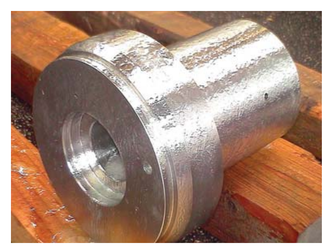
Small stainless steel parts can be effectively pickled with brush-on gel.

Your nearest national stainless steel development association should be able to advise on pickling product and pickling service suppliers locally available.