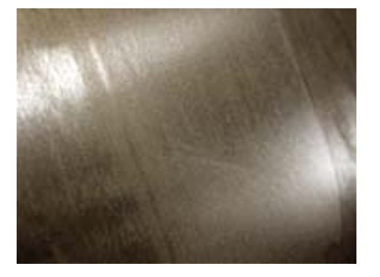
Stainless steel surfaces form a grey/black scale during hot rolling or forming. This tenacious oxide scale is removed in the steelmill by descaling.

Pickling is the removal of a thin layer of metal from the surface of the stainless steel. Mixtures of nitric and hydrofluoric acids are usually used for pickling stainless steels. Pickling is the process used to remove weld heat tinted layers from the surface of stainless steel fabrications, where the steel's surface chromium level has been reduced.