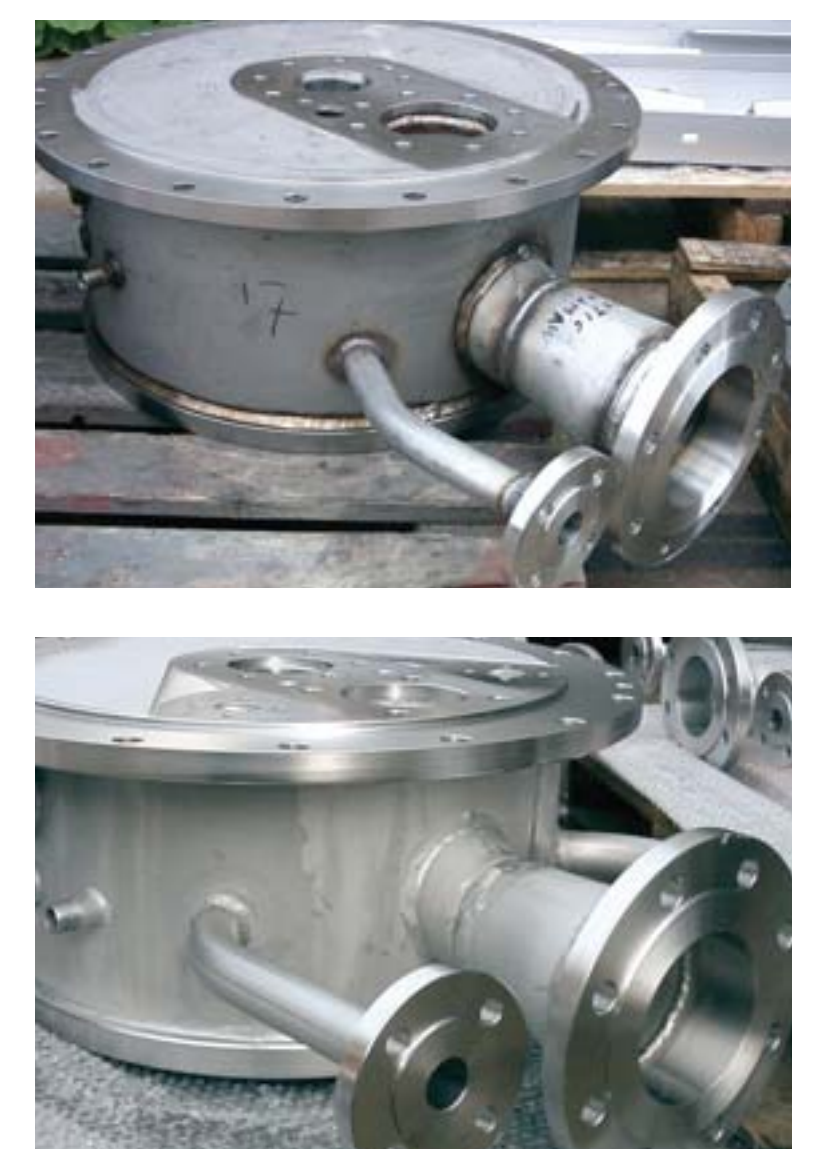
Heat tint left in welded areas of a complex fabrication can be effectively removed by pickling by immersion pickling. The corrosion resistance of the whole fabrication has been restored by pickling.

The pickling preparation supplier's instructions must be carefully followed when removing heat tint as they contain acids harmful to health. Surface pitting can also result on the surface of the stainless steel, if excessive contact times are used.