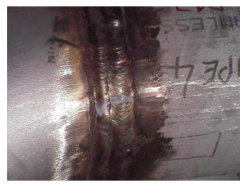
Welded stainless part in the "as welded" condition: the oxide scale is likely to give way to corrosion if not properly removed.

As heat tints are formed on the surface of stainless steel chromium is drawn to the surface of the steel, as chromium oxidises more readily than the iron in the steel. This leaves a layer at and just below the surface with a lower chromium level than in the bulk of the steel, and so a surface with reduced corrosion resistance.