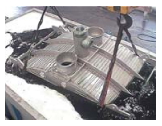
Tank immersion pickling: If the dimensions of the fabricated part match the tank dimensions, the complete part can be immersed in a tank for pickling. Immersion temperature and duration affect the result of the pickling process.

Spray pickling: This process offers the advantage of on-site execution but necessitates appropriate acid disposal and safety procedures.