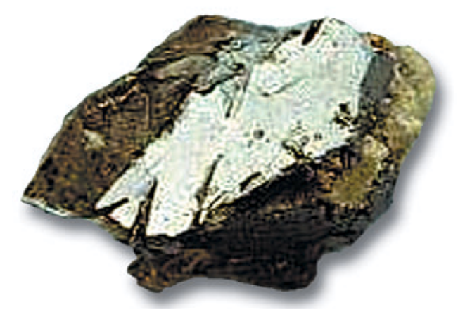
Graphite – Lake Harbour (Canada)

cooled too slowly after hot working or annealing or subsequently reheated (as in welding operations). The consequence is an unwanted precipitation of carbide-containing chromium. This precipitation of carbon takes place at grain boundaries and is referred to as sensitisation. It has been demonstrated that the loss of chromium associated with the carbide precipitation lowers corrosion resistance and brings about susceptibility to localised corrosion, i.e. intergranular corrosion, at the grain boundaries following the network of chromium carbides.