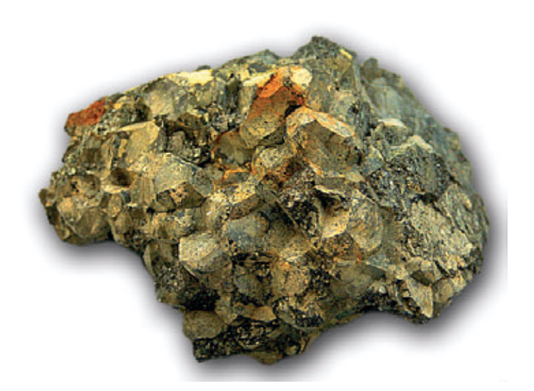
Chrome ore: Chromite – Mine Dyne (New Caledonia)

Chromium is the 13<sup>th</sup> most abundant element in the Earth's crust, with an average concentration of the order of 400 ppm. 14 million tonnes of marketable chromite ore were produced in 2002. South Africa accounted