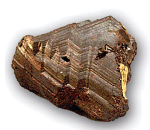
Titanium ore: Rutile - Parsksburg (USA)