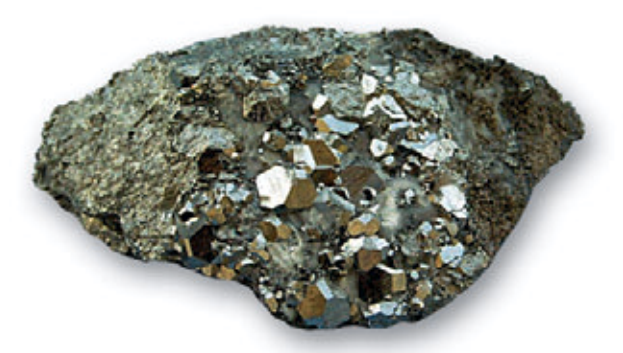
Cobalt ore: Skutterudite – Irhtem (Morocco)