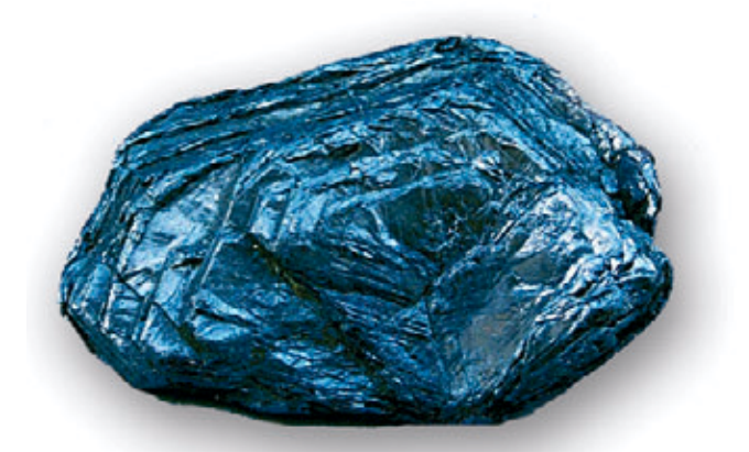
Molybdenum ore: Molybdenite – Noerkheia (Norway) – Courtesy of Ecole des Mines de Paris

Following Scheele's suggestion, another Swedish chemist and mineralogist, Peter Jacob Hjelm, isolated the first metallic molybdenum in 1782 by reducing molybdic oxide ( MoO_3 ) but it was not until 1895 that the