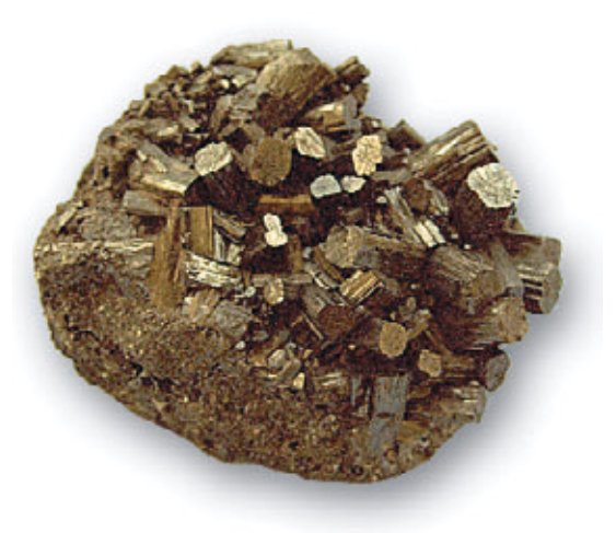
Manganese ore – Manganite - Ilfeld (Germany)

Manganese is the 12^{\text{th}} most abundant element in the Earth's crust, with an average concentration of the order of 1,100 ppm. The major manganese deposits are essentially situated in South Africa, China, Australia, Gabon, Brazil, Ukraine, India, Kazakhstan and Mexico. The world production of manganese ore is in the order of 20 million tonnes per year and the world reserves are estimated to be 600 million tonnes of ore. There are also large manganese reserves on deep ocean floors in the form of polymetallic nodules. They are estimated at 2 - 300 million tonnes of manganese.