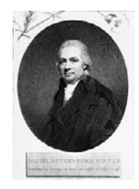
Daniel Rutherford (1749 – 1819), Scottish chemist and physicist. As a physicist, he was one of the first to recognise the importance of "specific heat". As a chemist, he was credited with discovering magnesia and carbon dioxide.

Nitrogen (as carbon) is an interstitial element in steel because its atomic size is sufficiently small relative to that of iron, chromium or nickel, to allow this element to enter the \alpha -alloys and the \gamma -alloy lattices as interstitial solute atoms. The solubility of nitrogen is greater in austenite ( \gamma ) than in ferrite ( \alpha ), because of the larger interstices available. The solubility for nitrogen in austenite is as high as 2.4% while in ferrite it is only 0.1% at the temperature of 1,100° C. Nitrogen has a