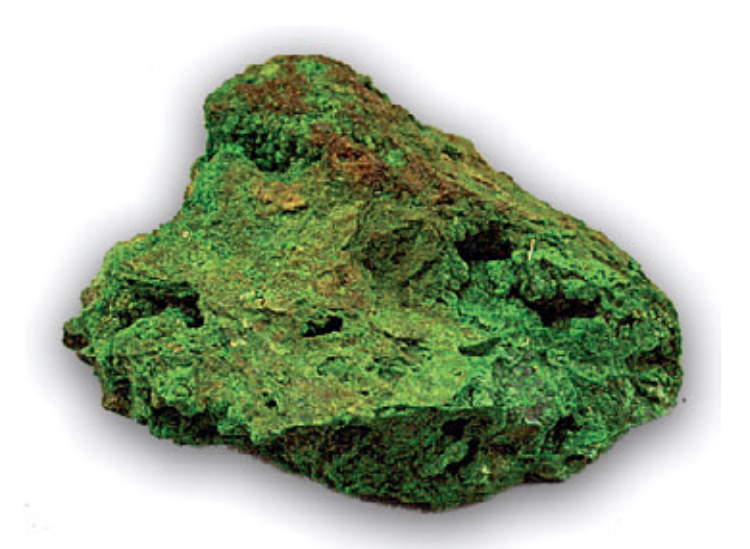
Nickel ore: Garnierite (New Caledonia)

In 1751, the Swedish mineralogist and chemist Axel Fredrik Cronstedt discovered nickel as an impurity in an ore-containing niccolite (nickel arsenide). He reported it as a new element and proposed the name of nickel for it. This element is 24<sup>th</sup> in the order of abundance in the Earth's crust with an average concentration of 80 ppm. The two major sources of this metal are the nickelbearing sulphide inside iron-copper pyrites deposits in Canada, Russia (Siberian mines), New-Caledonia and South-Africa and the nickel-bearing laterite deposits such as garnierite (South East-Asia, Australia and the Caribbean). World mine production of nickel totalled 1.26Mt in 2001, the highest output ever recorded. The principal producing countries were Russia (20%), Canada (15%), Australia (15%) and New Caledonia (10%).