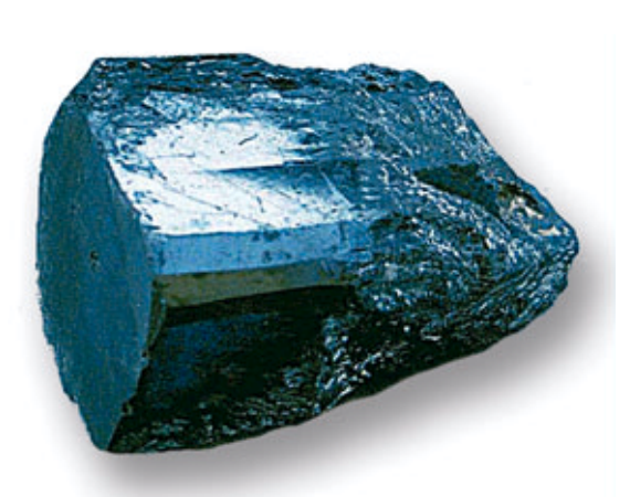
Niobium ore: Niobite – Mina Gerais (Brazil)

The earliest information about niobium usage is dated 1925, when it was utilised to replace tungsten in tool steel. However, until the beginning of the 1930s, niobium had no industrial importance. Niobium is efficient in